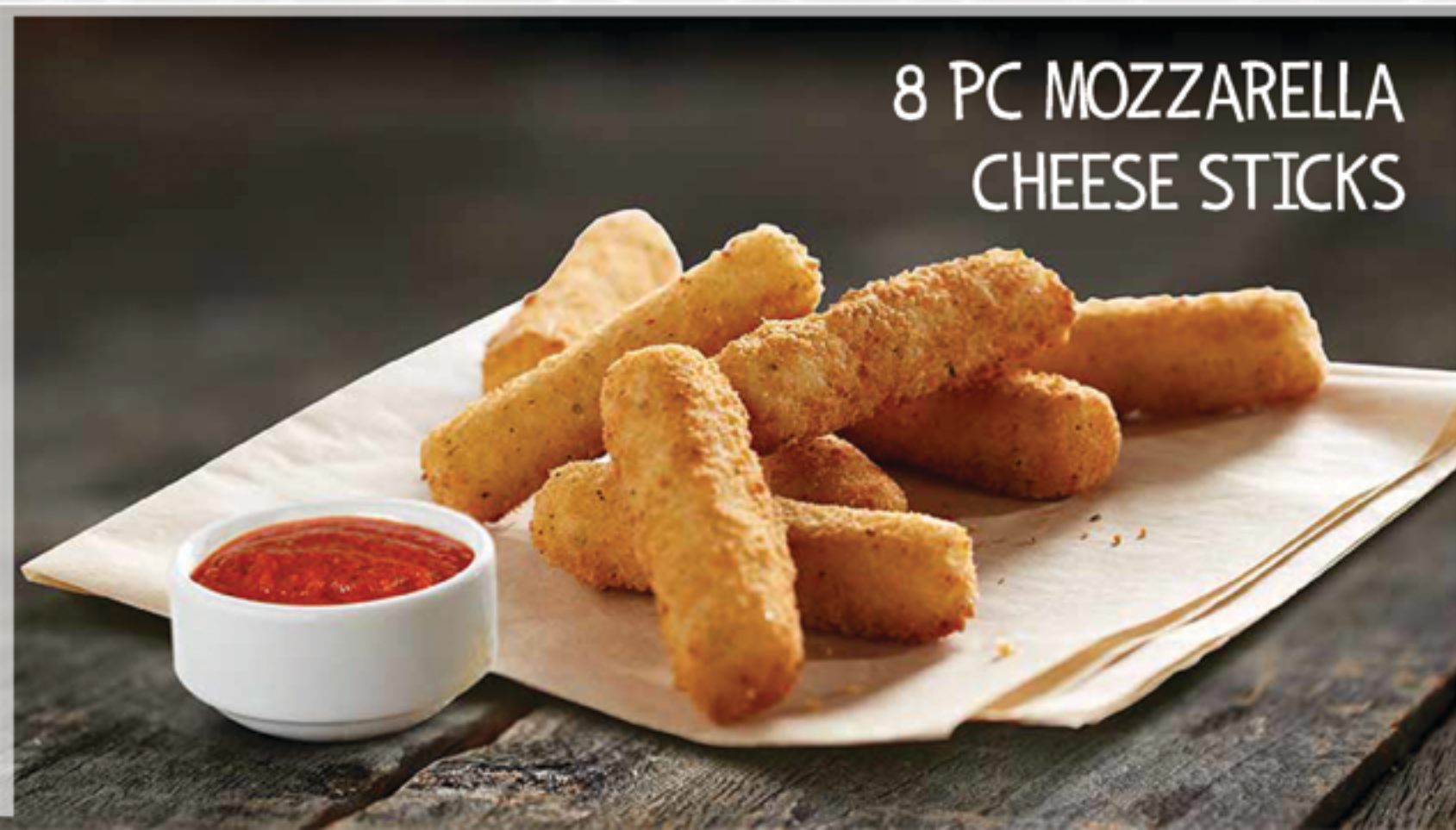
8 PC MOZZARELLA CHEESE STICKS