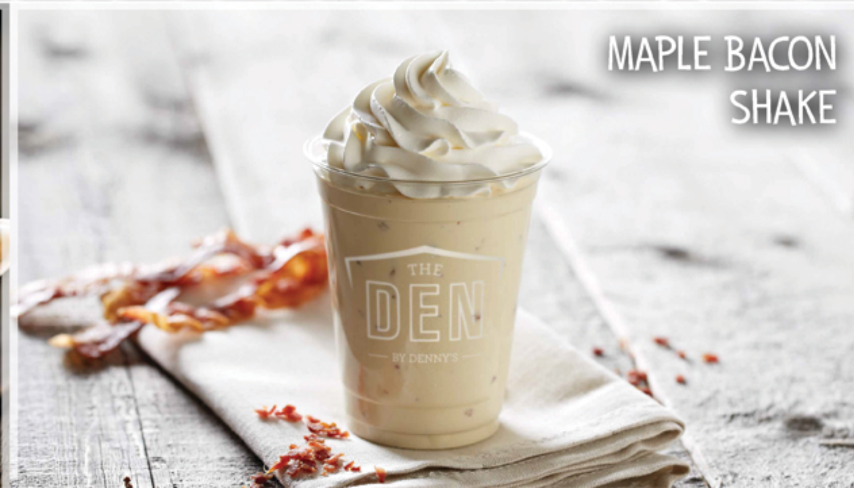
MAPLE BACON SHAKE